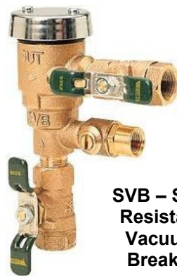
SVB – Spill Resistant Vacuum Breaker

For more information or for a copy of this publication in an alternate format, contact Planning & Development at (602) 262-7811 voice or TTY use 7-1-1.