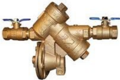
RP – Reduced Pressure Principle Assembly