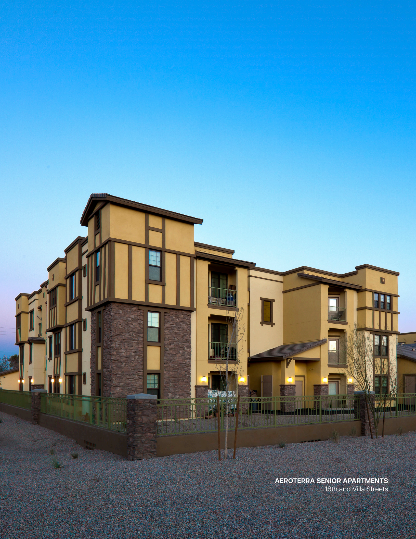
AEROTERRA SENIOR APARTMENTS 16th and Villa Streets