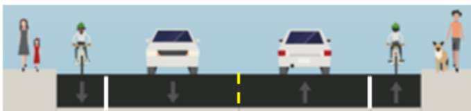
Durango St to 79 th Dr