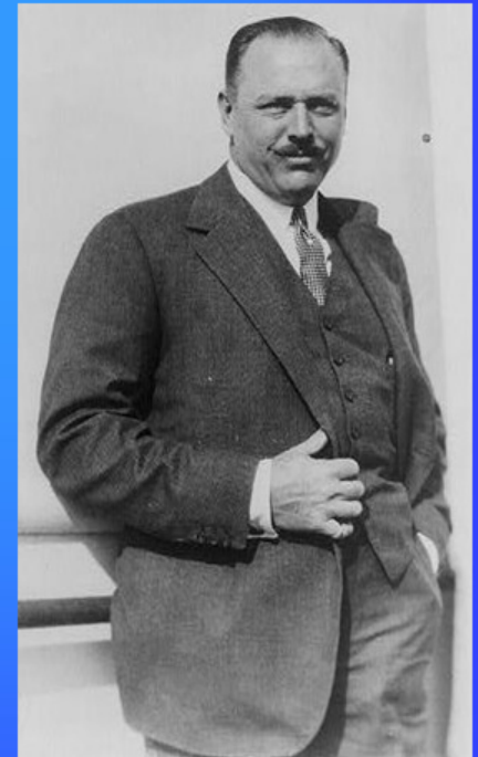
New York Representative, Robert Bacon