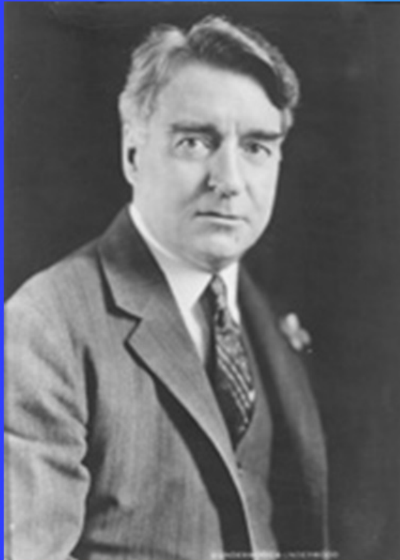
New York Senator Royal S. Copeland