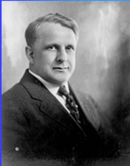
Pennsylvania Senator James John Davis